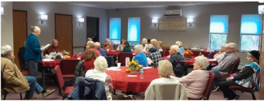
Friendship Club sharing Happy Memories