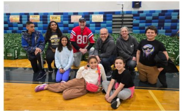
Confirmation kids (& families) packing Thanksgiving meals