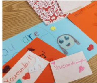
Cards of encouragement made by the Trailblazer youth group