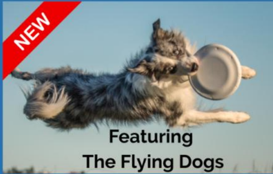
Featuring The Flying Dogs